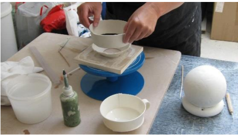
Two pieces of porcelain are joined using slip