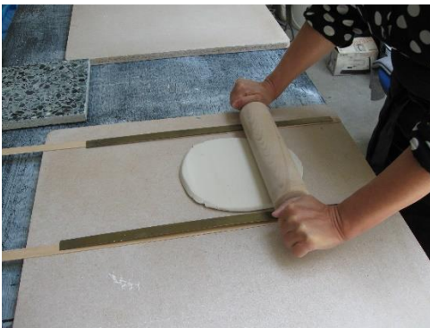
The porcelain is rolled into thin plates

Everything is done by hand without forms. Therefore, there are small differences in the individual products, and each product is unique.