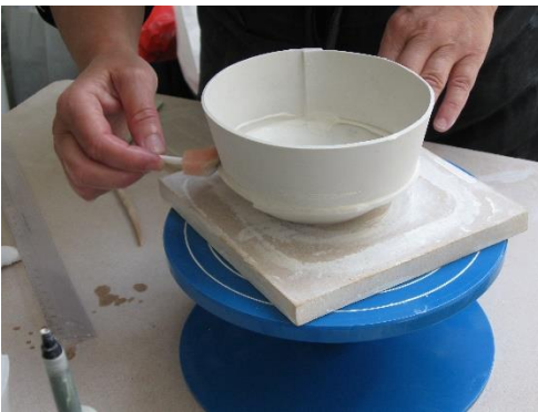
Excess slip is removed

A cup is created out of two pieces of porcelain and a bottom piece and handle is put on.