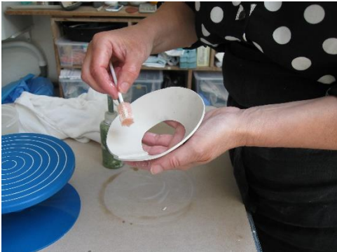
Pieces of porcelain are joined using slip (watery porcelain)