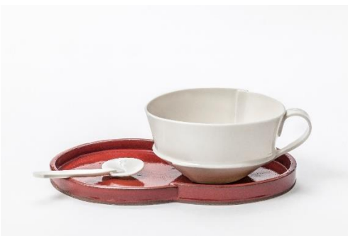
The finished cup with handle on a tray

The products are burned twice. The first burning is an biscuit firing which takes about 2 days from the start of burning until the oven is opened. Then the products are glazed and burned again at high temperatures, 1280 - 1290 degrees, for about 3 days. Through this process, the items become translucent.