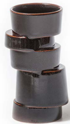
STACK03 · Mini Vase, dark brown · (h: 12 cm)