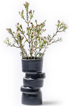
STACK03 · Mini Vase, dark grey · (h: 12 cm)