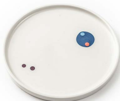
DOT06 · Small Plate · (d: 15 cm)