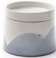
BLUE03 · Sugar Bowl · (h: 7,5 cm)