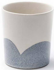
BLUE04 · Cup 15 cl. · (h: 7,5 cm)