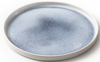
BLUE10 · Dinner Plate · (d: 24,5 cm)