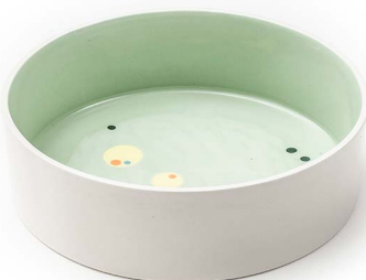
DOT10 · Big Shallow Bowl · (d: 21 cm)