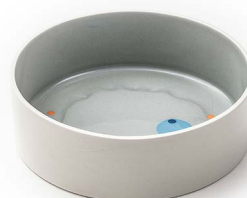
DOT11 · Medium Size Bowl · (d: 15,5 cm)