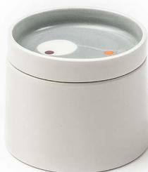
DOT05 · Sugar Bowl · (h: 7,5 cm)