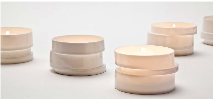
STACK04 · The Stacked Light House · (d: 8 cm, h: 5,5 cm)