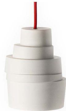
STACK05 · Lamp, white w. red cord