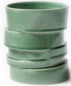
STACK02 · Wide Vase, deep green · (h: 15 cm)