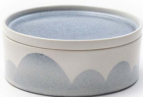
BLUE07 + BLUE05