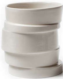
STACK02 · Wide Vase, white · (h: 15 cm)