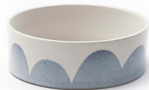
BLUE07 · Big Bowl 80 cl. · (d: 15,5 cm)