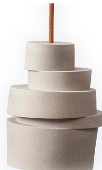
STACK05 · Lamp, light brown w. copper cord