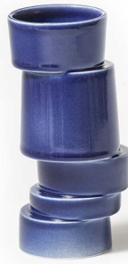
STACK01 · Tall Vase, dark blue · (h: 17 cm)