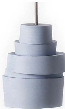
STACK05 · Lamp, dove blue w. grey cord