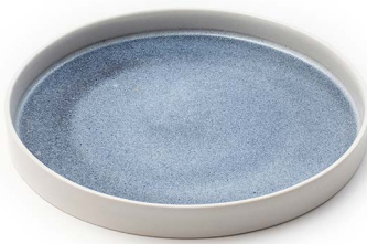
BLUE06B · Serving Dish · (d: 24 cm)