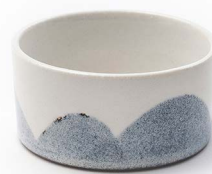
BLUE09 · Mini Bowl 10 cl. · (d: 7,5 cm)