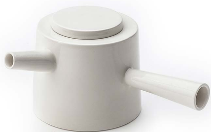
DOT01 · Teapot 80 cl. · (h: 12 cm)