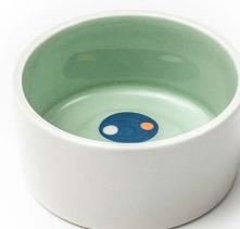
DOT14 · Mini Bowl 10 cl. · (d: 7,5 cm)