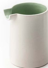
DOT04 · Milk Jug 25 cl. · (h: 7,5 cm)