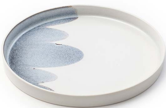
BLUE06A · Serving Dish · (d: 24 cm)