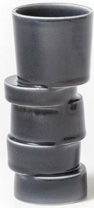
STACK01 · Tall Vase, dark grey · (h: 17 cm)