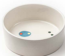
DOT12 · Small Shallow Bowl · (d: 12 cm)