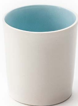
DOT03 · Cup 15 cl. · (h: 7,5 cm)