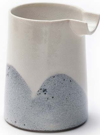
BLUE02 · Milk Jug 25 cl. · (h: 7,5 cm)