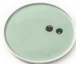
DOT07 · Big Plate · (d: 20 cm)