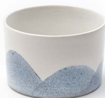
BLUE08 · Small Bowl 25 cl. · (d: 9 cm)