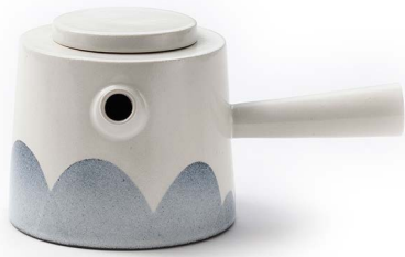
BLUE01 · Teapot 80 cl. · (h: 12 cm)