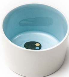
DOT13 · Small Bowl 25 cl. · (d: 9 cm)