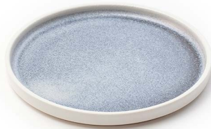
BLUE05 · Side Plate · (d: 16 cm)