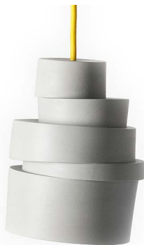
STACK05 · Lamp, light grey w. yellow cord