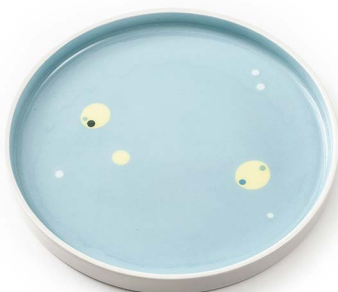
DOT08 · Dish · (d: 24 cm)